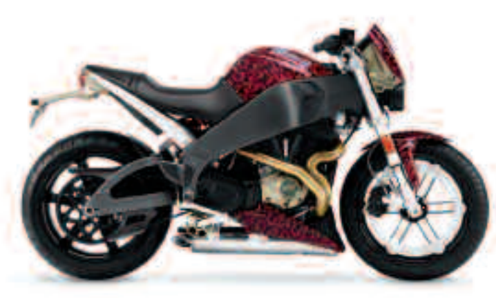
Each of these particular design and color combinations will only be available for about a year, which means a limited number will actually hit the streets.

The "decal" is melted away by a chemical process, leaving the paint bonded firmly to the solid-color substrate beneath it. Several layers of durable clearcoat are applied and the part is ready for shipping. It's a very efficient process, but one that turns out parts that are each slightly unique.