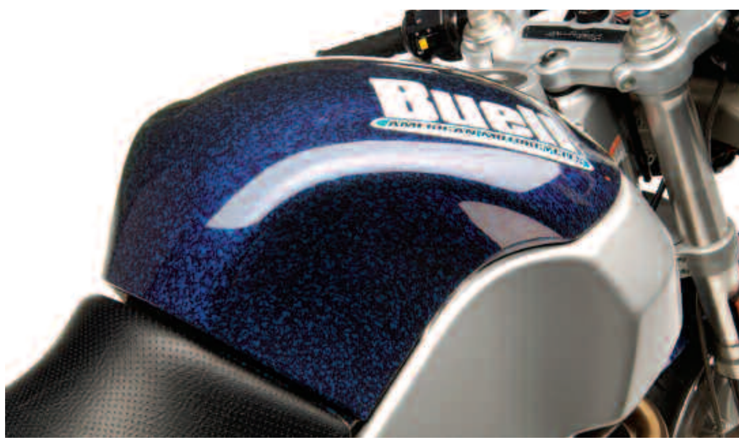
The black color you see in the "Shifter" design (and the red in "Voltage") is actually the solid color plastic showing through the paint. This helps ensure that the design will continue to "pop" through many years and miles of hard riding.

To make sure these new parts keep popping after years on the road, Buell exposes them to extensive UV testing.