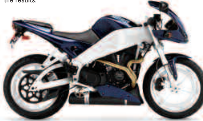
These four- and five-piece sets are easy to swap with your existing parts, making it a relatively simple matter to install them yourself.

"What we do is take a razor blade and cut an 'X' deep into the part," Braun says. "Then we put it in a humidity chamber, where the moisture tries to infiltrate the clearcoat and lift away the paint. It's a very tough test to pass, and it actually took us four tries to get the formula just right, but in the end we were extremely pleased with the results."